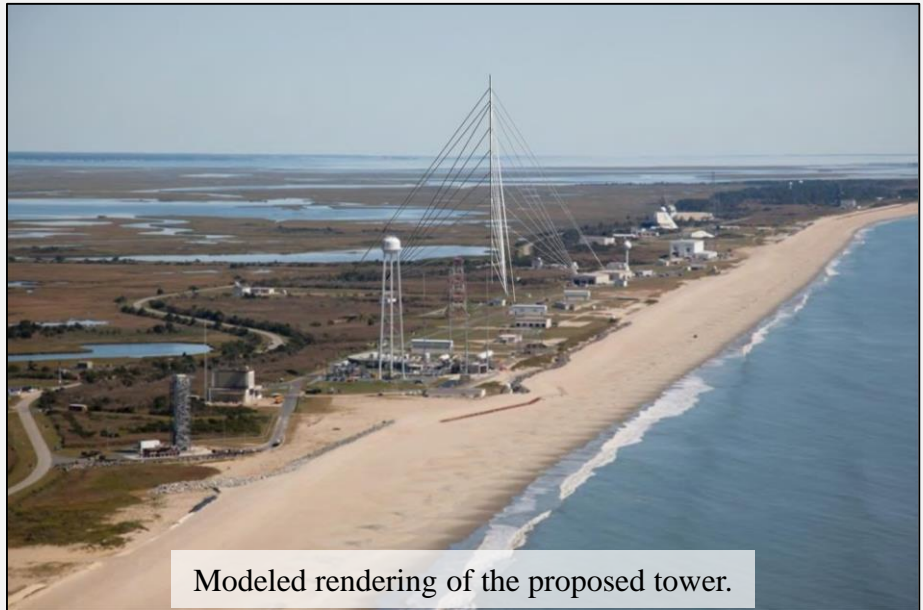
Modeled rendering of the proposed tower.

The United States Air Force (USAF) proposes to install and operate a 750-foot instrumentation tower at the NASA Goddard Space Flight Center's Wallops Flight Facility (WFF) to conduct testing in collaboration with other Department of Defense services and government agencies. NASA, the Naval Air Warfare Center – Aircraft Division, and Naval Sea Systems Command (NAVSEA SCSC) are cooperating agencies in this project.